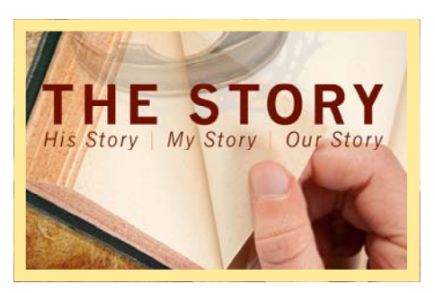
The Story: Jesus' Ministry Begins March 2-3, 2013 "The Story" Chapter 23: Matthew 4:1-11

Please use this space to take notes during the message today.